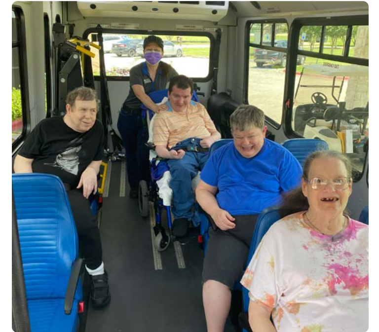
Above: Residents enjoy their first off-campus country drive on one of the new shuttles.