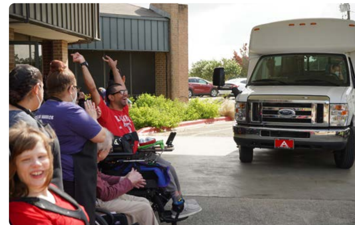
Above: Residents and staff get their first glimpse of the new shuttles.

The residents are excited about the future of off-campus outings and are already discussing their next activities when more become available to them. The next few months will be packed with fun new photos from all the adventures The Villa residents and staff go on.