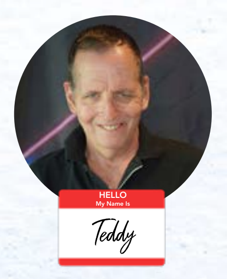
Dining Hall & Kitchen

"I've worked a couple years on campus. I bus tables, I clean, and more. I like it. I really like having a job because it makes me happy."