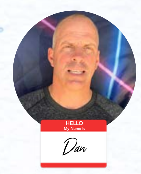
Marbridge Landscaping & McCoy's (front cover feature)

With our residents back in the work force, we thought it would be great to hear from them about their work, what they do, what they love about their jobs, and what it means to them to work. One resident will also share his employment history and the joys of retirement.