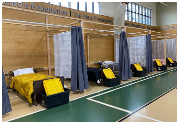
Above: Isolation units are set up in Victory Hall. Below: A widened shot of the isolation unit the day it was able to accommodate residents.