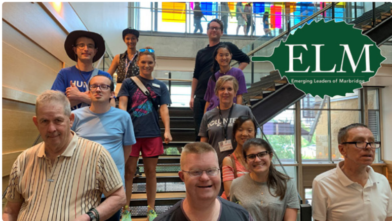
Above: ELM members and residents tour Austin Central Library on an outing. Below: Residents enjoy the city wide dog party at Zilker Park with members of ELM.

The group has returned to campus with monthly activities and their first event was an Olympics watch party for residents in Victory Hall in July. Their hard work and dedication to our mission, like all of our supporters, is pivotal to Marbridge's success.