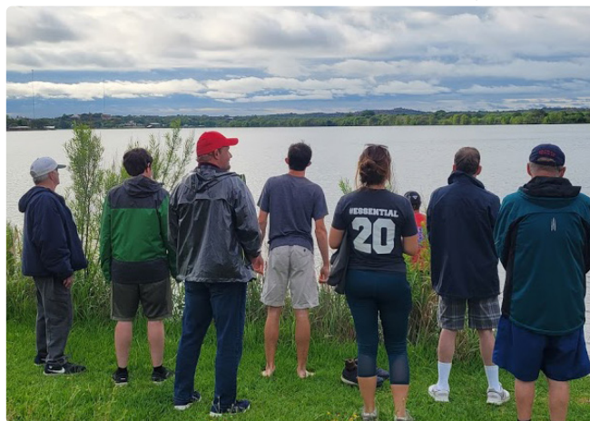
Below: Residents and staff stop to admire the beauty of Inks Lake.

See the fun had on the camping trip at Marbridge.org/photos