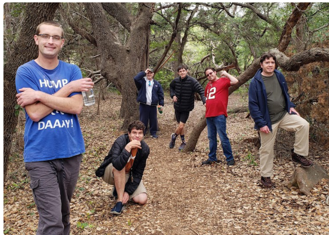
Above: Residents stop for a quick photo on their trail hike.

Staff will look for more extended trips for residents to take over the upcoming months.