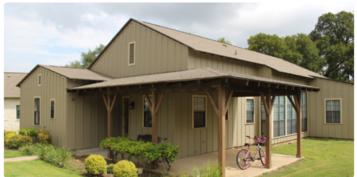
Above: Various stages of construction for the newest Cottage at The Village. Bottom Picture: What the new Cottage will look like upon completion.

Apply today for your loved one to move into the newest cottage at Marbridge.org/admissions